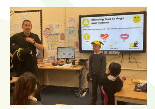
Learning About Responsible Pet Care with the Dogs Trust

Years 1 to 5 were treated to a special visit from the Dogs Trust, who delivered engaging workshops on the importance of caring for pets responsibly and staying safe around animals.